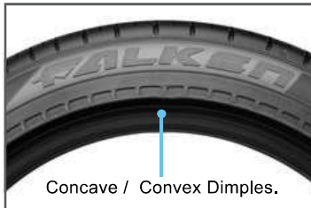
Concave / Convex Dimples.

The arrangement of concave/convex dimples lining the tyre's inner side produce an improved cooling effect. This reduces heat damage when driving with a flat tyre' thereby improving overall tyre durability.